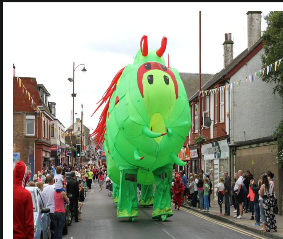
Civic Week Parade 2014