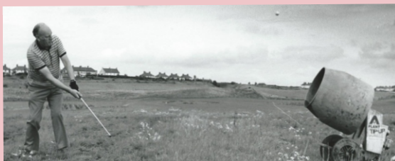
Mr G Ogilvie - having a few practice shots

In 1987, it was reported that the basis of a 9 hole golf course was to be created on the site of the former Dora opencast site. It was advised at that time, that the work to create greens and construct a clubhouse would be completed in approx 2 years. The course was ready to play in 1991.