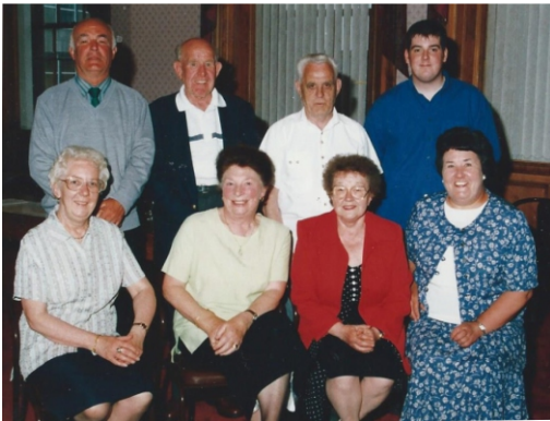
Some of Cowdenbeaths' previous community councillors

Did you see the proposals?. It really looks good. If you haven't seen the proposals yet, why not pop into the new Community Hub office and "have your say". The community council has also applied for funding for a heritage garden at Brunton Square.