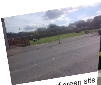
Current view of green site