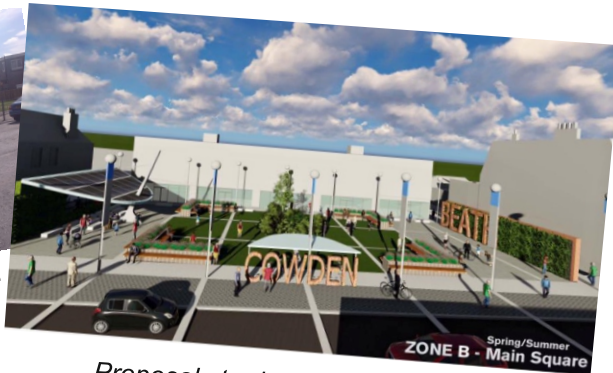
Proposals to develop the site

Funding has been secured to develop the 'green site' on the High St (opposite Partners Bar). Currently work is underway to remove the Japanese Knotweed which is in existence on the site. It's taking a wee bit longer to clear the knotweed than anticipated though.