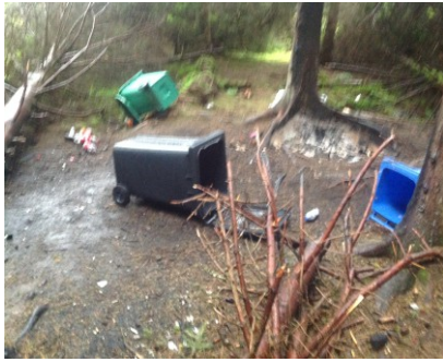
Vandalism at Community Woodland