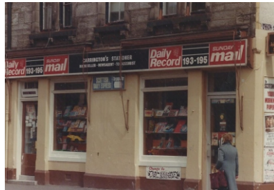
Carringtons Paper Shop (now Turkish Barbers).

As Britain could not import coal during World War II, the production of coal from mines in Britain had to be increased. From 1943 until 1948 one in ten of the young men called up was sent to work in the mines. These conscript miners were given the nickname “Bevin Boys”. Interestingly, some footballers later worked in the mines as an alternative to doing National Service so they could still play football. Celtic and Scotland great Bobby Collins worked in the pits in Fife in the early 1950s and trained at Central Park with Cowden for a number of years. These young Miners needed accommodation and in many areas special Hostels were built to house them. In Fife, there were Hostels in Methilhill, Muiredge, Comrie and Townhill. There was also one at Cowdenbeath built in 1944. Originally, this was planned for Viewfield, Lumphinnans but it was later decided to build it at Leuchatsbeath, Cowdenbeath. The Hostel was in effect a camp which consisted of 66 Nissen huts and 19 larger huts. Its now the site of the Glenfield Industrial Estate after the Miners Hostel site was bought via a Compulsory Purchase Order in 1967. The Hostel over its lifetime hosted Miners, dockyard workers, Poles and