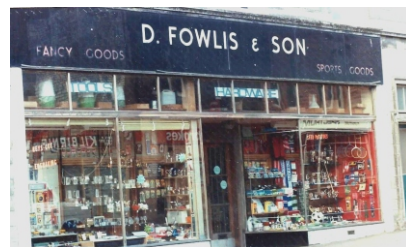
Fowlis (now Vape Shop).